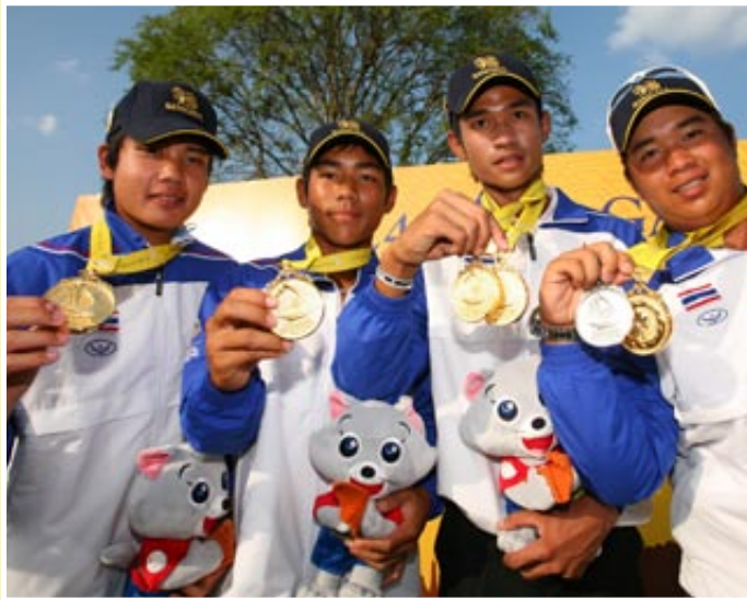
Men's Team Gold Medalist (Thailand)