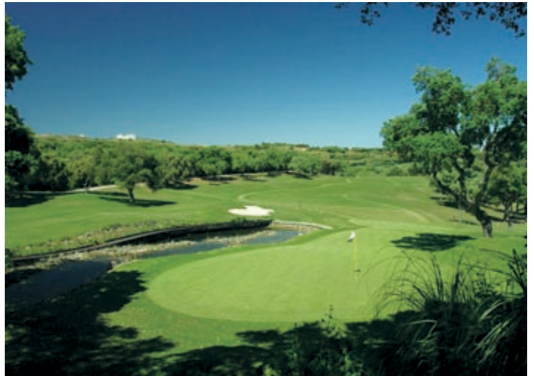
Club de Golf Valderrama