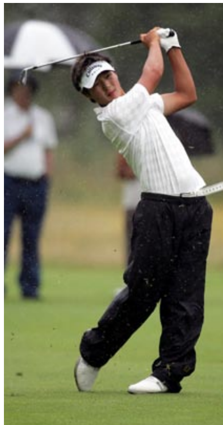
Kiwi Danny Lee