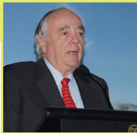
Robert Trent Jones Jr speaking at the Summit