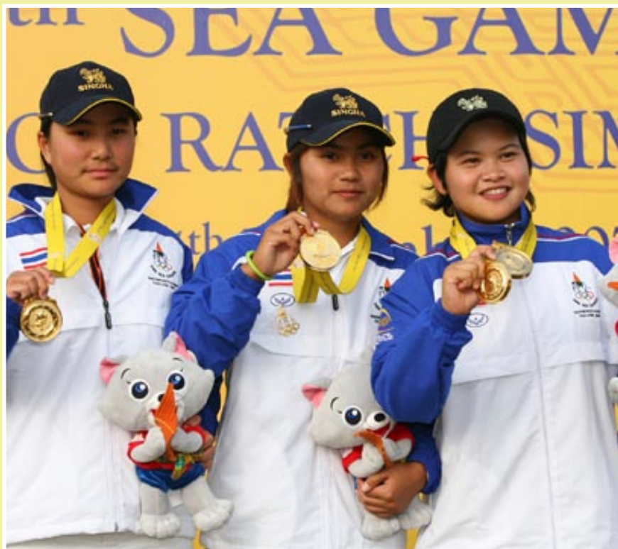
Women's Team Gold Medalist (Thailand)