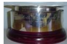
NSW Women's Foursomes Trophy

The 2011 Men's and Women's NSW Foursome's Championship is being held at Oatlands Golf Club on Sunday 28 August 2011. The Championship will be stroke play over 36 holes, with both morning and afternoon rounds.