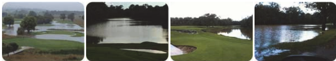
Photos of Mt Broughton Golf & Country Club, New Brighton Golf Club and the Macquarie Links Golf Course.

With summer disappearing into Autumn, numerous golf events across NSW were cancelled over the week, including the Golf NSW Women's Summer Meeting which was to be held at Bowral, Highlands, Moss Vale and Mt Broughton from 5-8 March. While many clubs have finally been able to move towards normality this weekend as the weather improved across the state, some courses will need a bit more time to recover as a result of the inundation of rain and flooding.