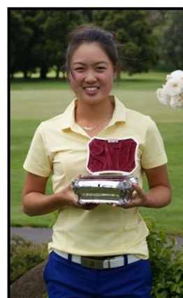
Minjee Lee (Western Australia)