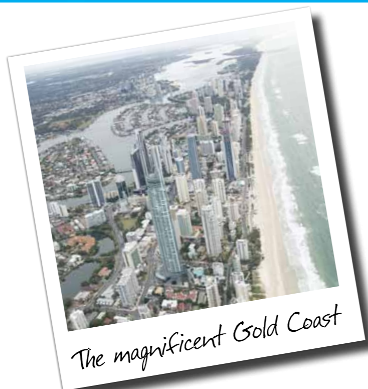
The magnificent Gold Coast