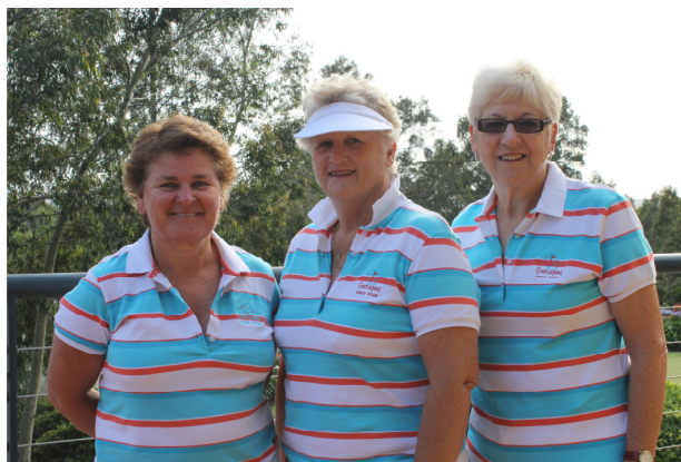
2011 NSW Women's 3BBB Team Classic State Champions – Gerringong Golf Club

Dress: Smart Casual Venue: Flooded Gums Restaurant, Bonville Golf Resort 6.30pm Pre- Dinner drinks 7.00pm Dinner will be served Presentation of trophies during dinner 10.30 pm Close