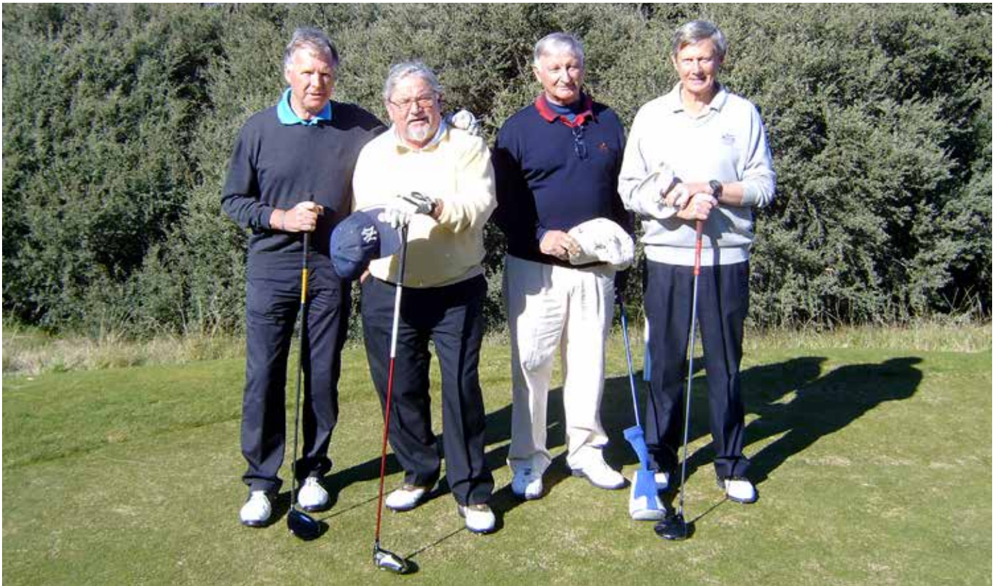
Semi-finalist on the 1st tee East