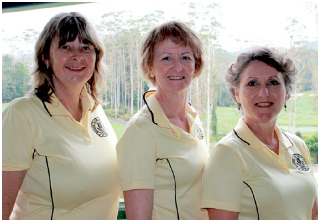
2012 NSW Women's 3BBB Champions: Bonnie Doon Golf Club

Results and prize winners will be available daily at www.golfnsw.org . You can also check out all the photos on our facebook page. Log on, tag yourself, and make a comment.