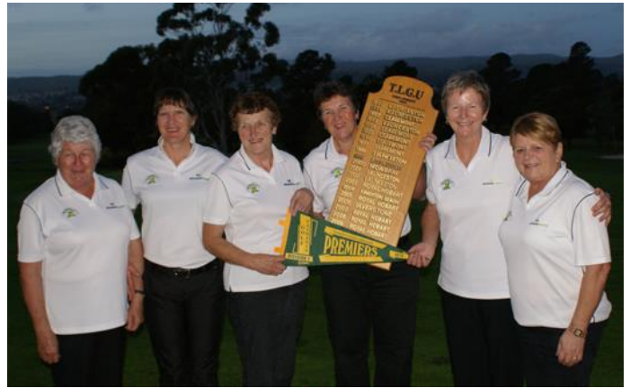
Division One Champions Mowbray Golf Club