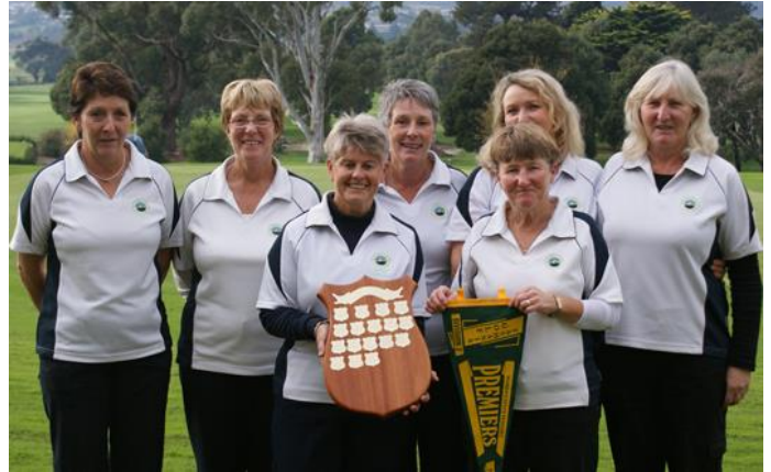
Division Two Champions Scamander River Golf Club