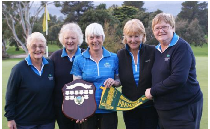
Division Three Champions Riverside Golf Club