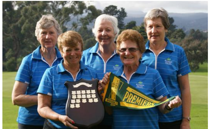
Division Three Champions Riverside Golf Club