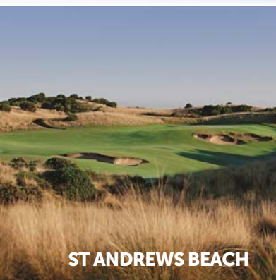
ST ANDREWS BEACH