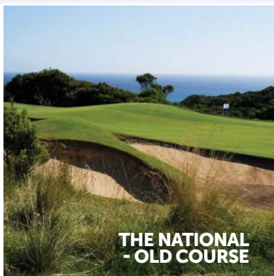
THE NATIONAL - OLD COURSE