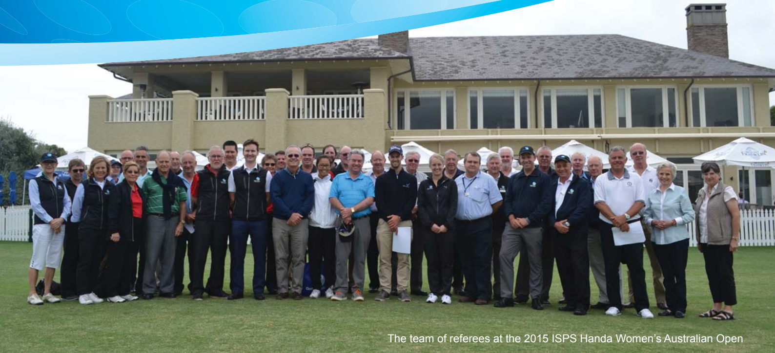
The team of referees at the 2015 ISPS Handa Women's Australian Open