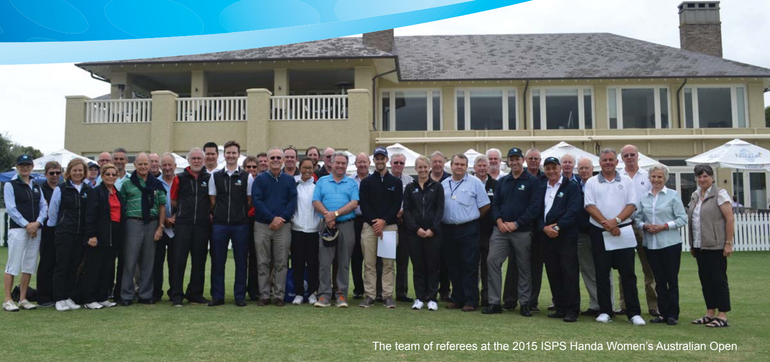
The team of referees at the 2015 ISPS Handa Women's Australian Open