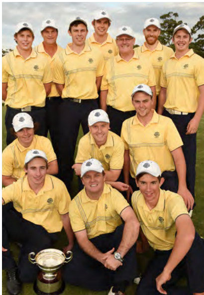
2014 GV Pennant Men's Division 1 Winners: Commonwealth

(Division 5) and Settlers Run (Division 6). Other Women's Divisional winners included; Long Island (Division 2), Sunshine (Division 3), Rossdale (Division 4) & Gisborne (Division 5)