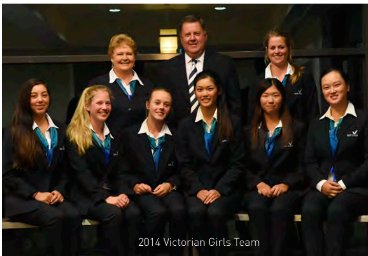
2014 Victorian Girls Team