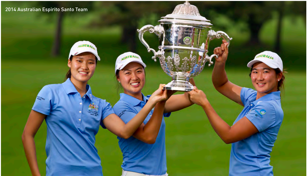
2014 Australian Espirito Santo Team