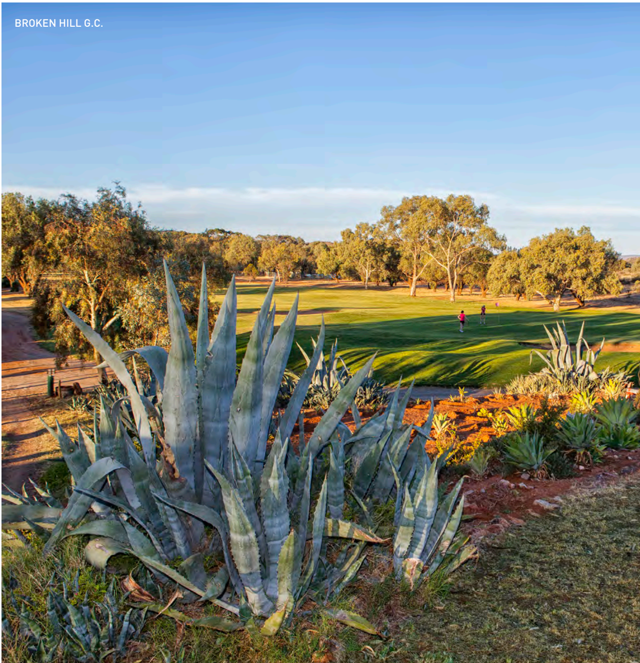
BROKEN HILL G.C.