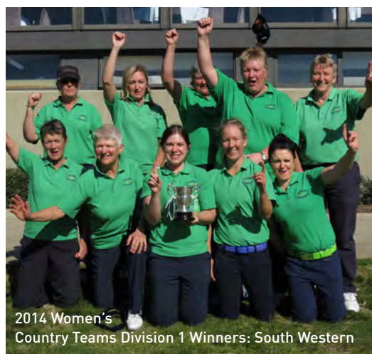
2014 Women's Country Teams Division 1 Winners: South Western