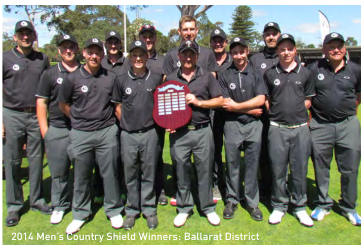
2014 Men's Country Shield Winners: Ballarat District

Other Men's Divisional winners included; Sanctuary Lakes (Division 2), Rosanna (Division 3), Gisborne (Division 4), Eastwood