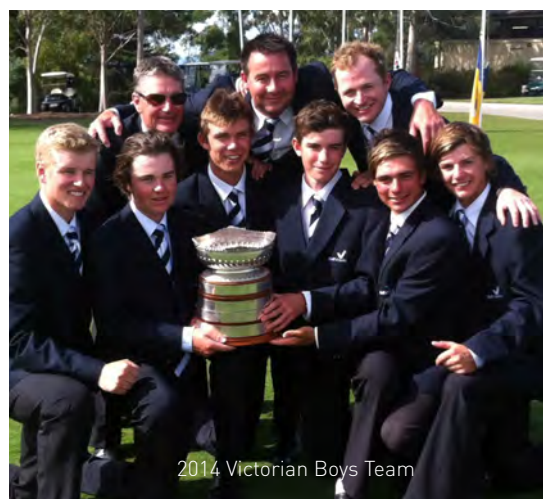
2014 Victorian Boys Team