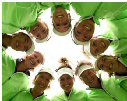
2014 GV Pennant Women's Division 1 Winners: Metropolitan