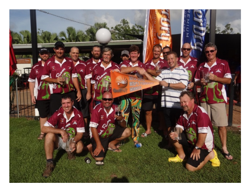
Humpty Doo and Rural Area Golf Club – Winning Men's Pennant Team

Humpty Doo Golf Club claimed the title after consistent performances all season to run out winners over Darwin RAAF Golf Club. After finishing in top position after the regular season, Humpty Doo have made the most of their home course advantage by defeating Darwin RAAF by six matches to 3 to be crowned 2014-15 Hahn SuperDry Pennant Champions.. Palmerston were able to account for Katherine in the battle for 3rd and 4th. Final Placings: 1st - Humpty Doo, 2nd - Darwin RAAF, 3rd - Palmerston, 4th - Katherine, 5th - Jabiru.