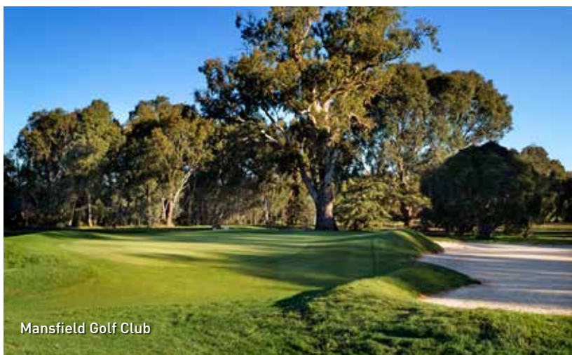
Mansfield Golf Club

In total, seven of the 15 District Associations are now amalgamated entities representing both women's and men's golf in country Victoria.