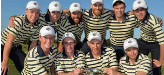
2015 GV Pennant Men's Division 1 Winners: Commonwealth