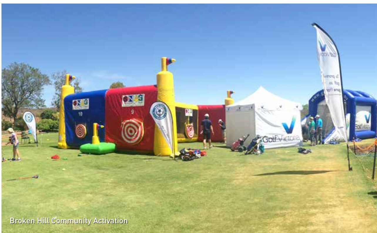
Broken Hill Community Activation

PlayGolf is the umbrella brand for Golf Victoria's Adult Development pathway, created to include Swing Fit, PlayGolf Clinics and on-course mentoring as part of club membership options offered to participants.