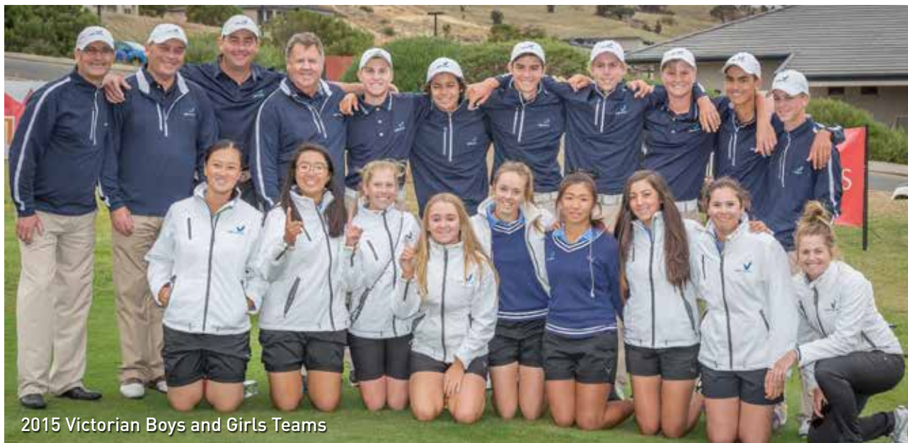
2015 Victorian Boys and Girls Teams