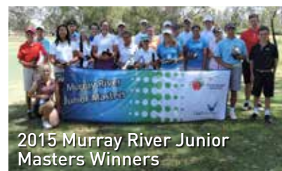
2015 Murray River Junior Masters Winners