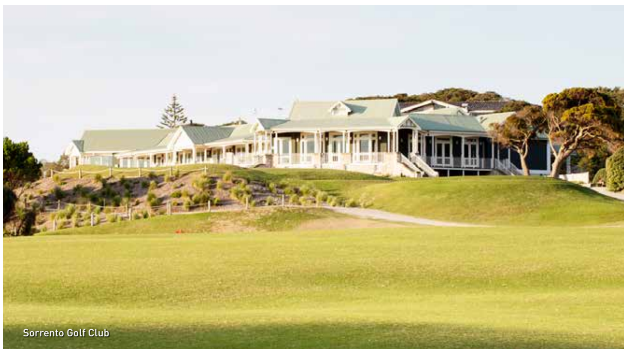
Sorrento Golf Club