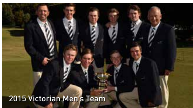
2015 Victorian Men's Team