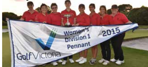
2015 GV Pennant Women's Division 1 Winners: Huntingdale

Song in a sudden death playoff that lasted three holes.