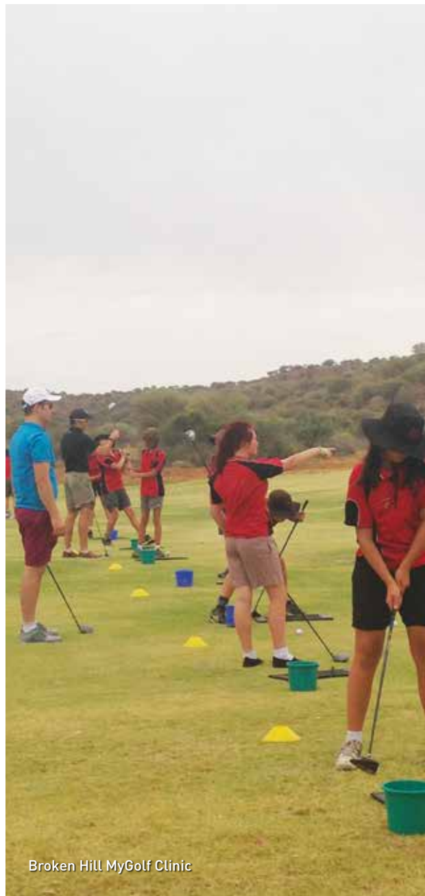
Broken Hill MyGolf Clinic