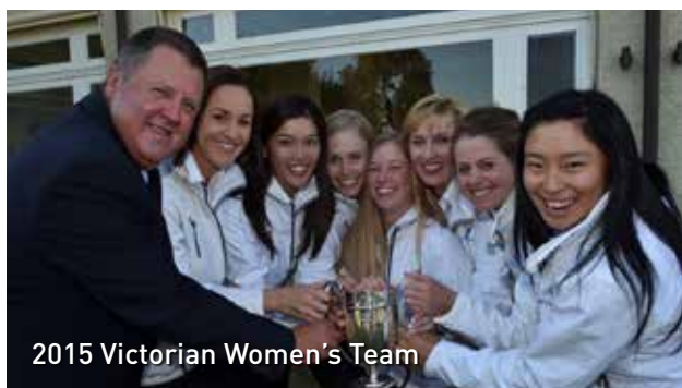
2015 Victorian Women's Team