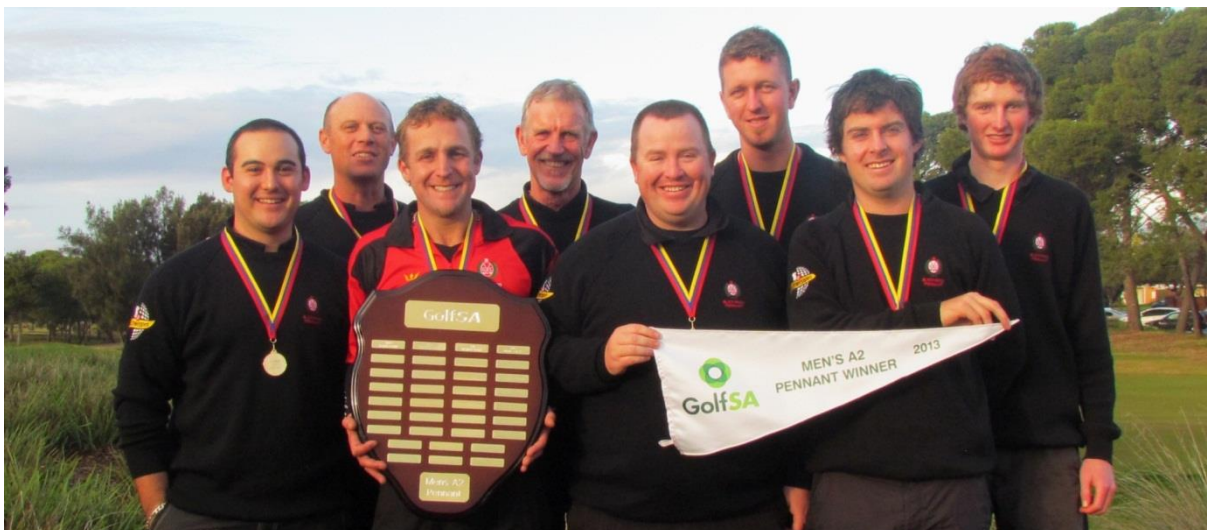
A2 Premiers in 2013

This season they should claim a few scalps and finish mid-pack.