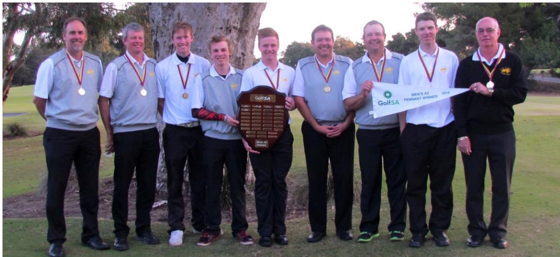
A2 Premiers in 2014