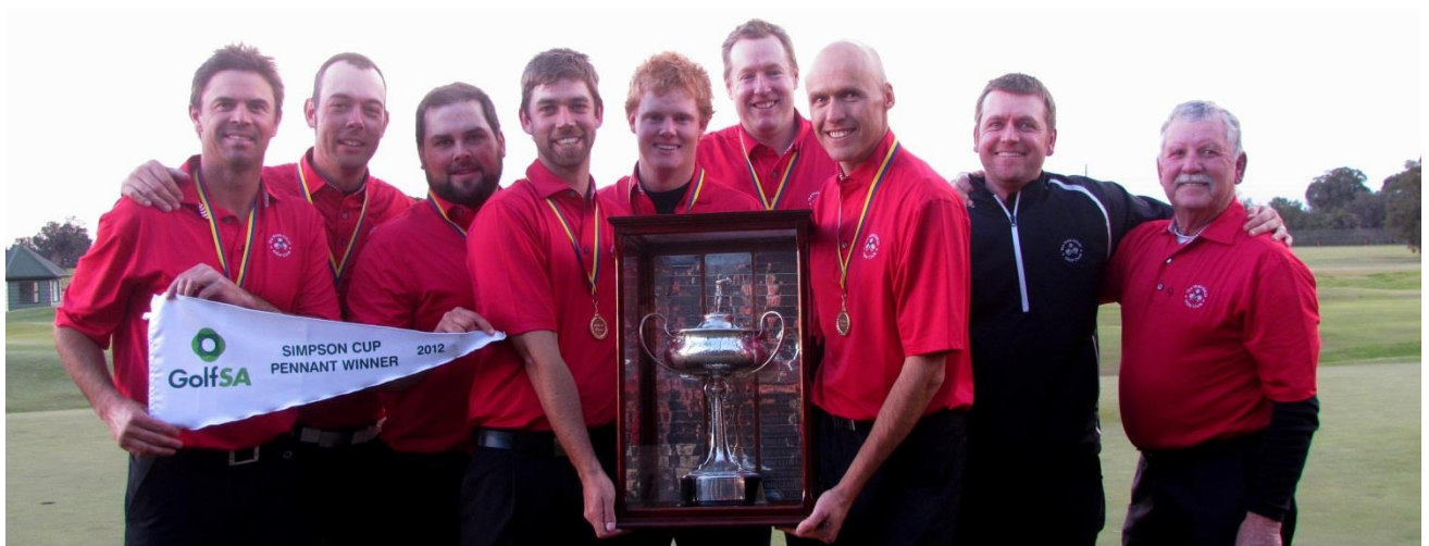
Tea Tree Gully pictured in 2012 after winning their third Simpson Cup in a row

The Gullies field a strong team year after year and are always around the mark. With plenty of depth they should feature strongly.