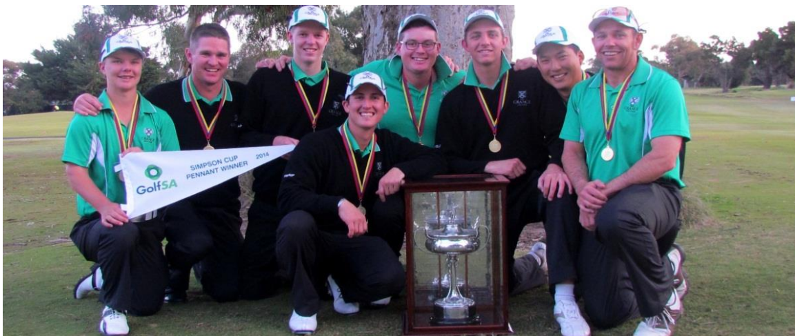
2014 Winning Simpson Cup Team

Grange too, has lost some key players but still has the depth and experienced players to push for a finals berth.