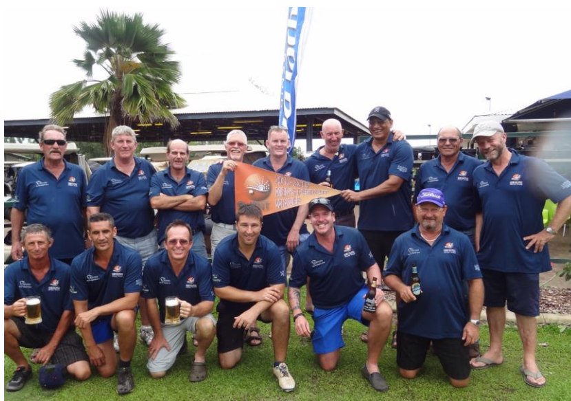
Palmerston Golf Club – 2015-16 Hahn SuperDry Pennant Champions

Palmerston GC claimed the title after consistent performances all season to run out winners over defending Champions Humpty Doo Golf Club. After finishing in top position after the regular season, Palmerston made the most of their home course advantage by defeating Humpty Doo by 6 ½ matches to 2 ½ to be crowned 2015-16 Hahn SuperDry Pennant Champions.