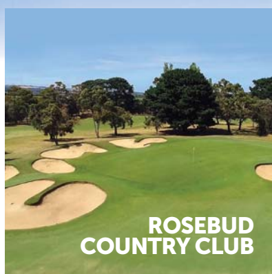
ROSEBUD COUNTRY CLUB