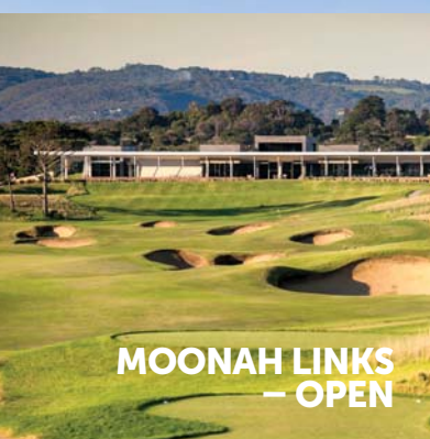
MOONAH LINKS – OPEN

PLAY 4 TOP COURSES ON THE MAGNIFICENT MORNINGTON PENINSULA – AUSTRALIA'S #1 GOLF DESTINATION!