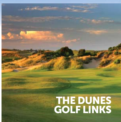
THE DUNES GOLF LINKS