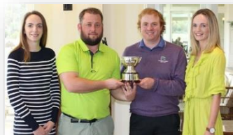
Men's AM Winners