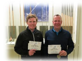
Men's PM Winners