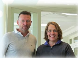
Women & Mixed Winners