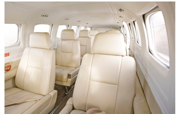
Clockwise from top: The ultimate in on-course accommodation and dining, Lost Farm; Air Adventure's Outback Jet; Play the exciting new Cape Wickham Course on King Island; Ocean View Suite, The Lost Farm