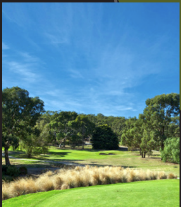
THE VINES THURSDAY 4 OCTOBER 4BBB STABLEFORD 8.30am shotgun start