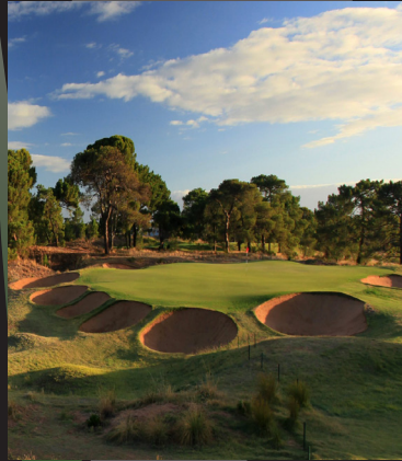
ROYAL ADELAIDE TUESDAY 20 FEBRUARY 3BBB STABLEFORD 8.30am shotgun start

Visit www.golfsa.com.au >Events / Golf SA Events to view individual event booking details