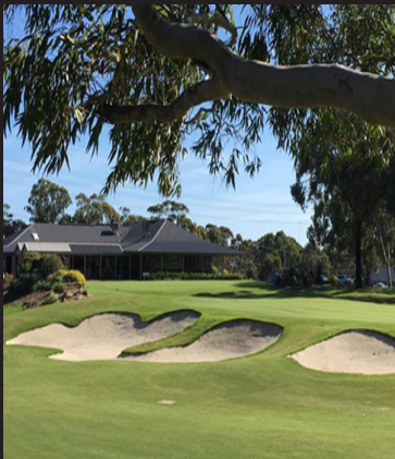
THAXTED PARK TUESDAY 3 MAY CANADIAN FOURSOMES 9.00am shotgun start