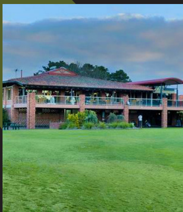
BLACKWOOD TUESDAY 20 NOVEMBER CANADIAN FOURSOMES 9.00am shotgun start