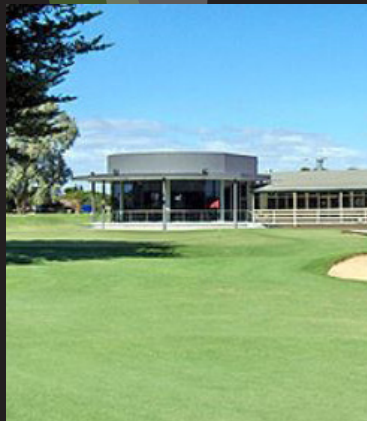
WEST LAKES THURSDAY 5 APRIL PINEHURST FOURSOMES 9.00am shotgun start