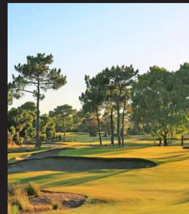
THE GRANGE TUESDAY 15 MAY 4BBB STABLEFORD 8.30am shotgun start