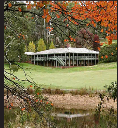
THE STIRLING THURSDAY 22 MARCH CANADIAN FOURSOMES 9.00am shotgun start