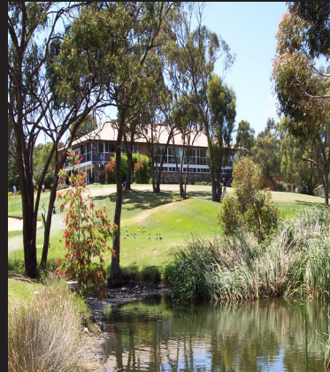
FLAGSTAFF HILL THURSDAY 15 MARCH 4BBB STABLEFORD 8.30am shotgun start