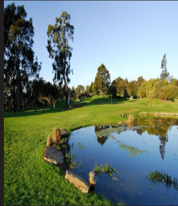
MOUNT OSMOND WEDNESDAY 28 FEBRUARY PINEHURST FOURSOMES 8.30am shotgun start