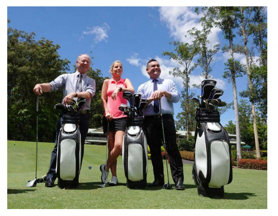
LAUNCH OF THE AUSTRALIAN LADIES CLASSIC - BONVILLE