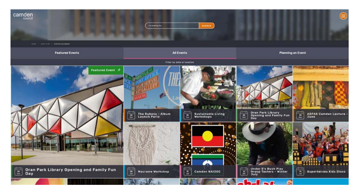
THE CAMDEN COUNCIL EVENTS CALENDAR