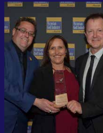
2018 Inclusion Award Winner PAKENHAM GOLF CLUB

just golf, a venue the entire community can enjoy. It future proofs the entire facility and along the way engages with some of the most inspiring people who teach us all to embrace life no matter what. All members support the vision for Pakenham Golf Club and are proud of what the club is achieving.