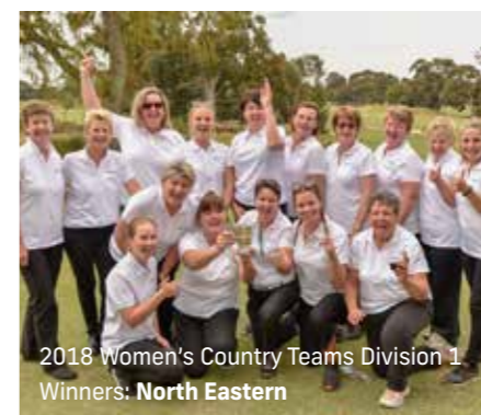
2018 Women's Country Teams Division 1 Winners: North Eastern

the South Australian Country Team in the annual match played at the Mt Gambier Golf Club in South Australia during late October. The eight-man Victorian Country Team won