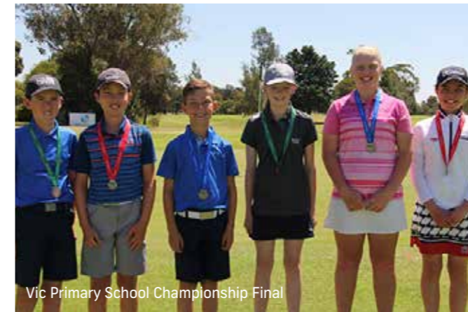
Vic Primary School Championship Final

With the introduction of 9-hole division events and 18-hole state finals across both secondary and primary events it provides a level of competition that will encourage the beginner to get out on the course, yet also provide the skilled golfer a chance to take out the state title.