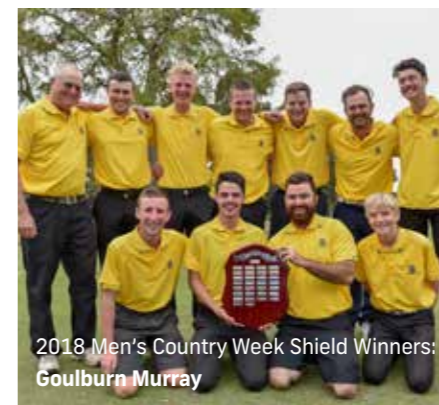
2018 Men's Country Week Shield Winners: Goulburn Murray

- The Victorian Country Men's Team defeated