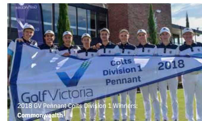
2018 GV Pennant Colts Division 1 Winners: Commonwealth