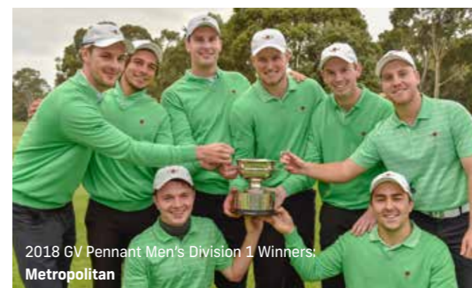
2018 GV Pennant Men's Division 1 Winners: Metropolitan

Metropolitan defeated Kingston Heath by four matches to three in the Men's final while the Commonwealth Colts team was victorious over Royal Melbourne by three matches to two in the Colts final.