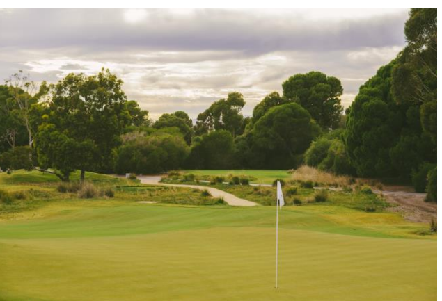
Kooyonga Golf Club